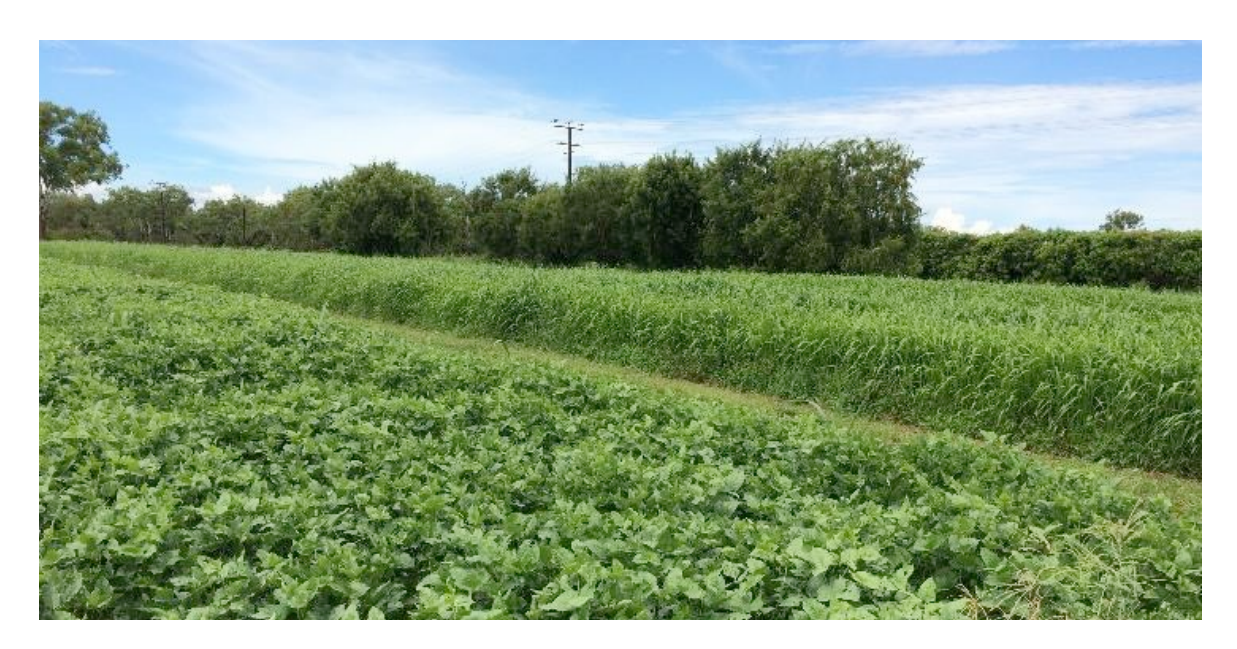
Figure 2. Cover crop trials at Lambells Lagoon.