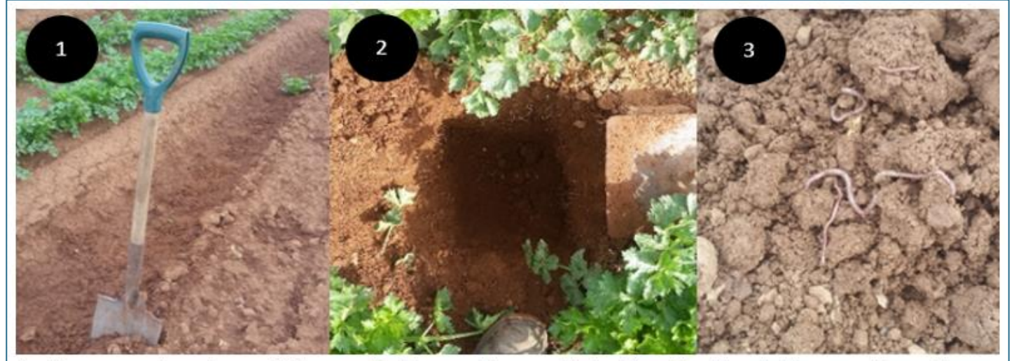
Figure 1 How of check earthworm numbers

Previous studies suggest a healthy minimum number of earthworms is 100-200 per square metre, or average of at least two to four earthworms per 150mm x 150mm x 300mm deep spade full. This level of earthworms will continually work, aerate and fertilise the upper 300-500mm of topsoil, depending on the depth of the soil. An earthworm population of this size or more will start to have visible impact on the soil structure, with burrows and 'casts' or droppings resulting in improved water infiltration and aeration. This can reduce the need for deeper tillage. The higher the earthworm population, the more work they will do to improve soil structure and health, and this further improves conditions for earthworm activity.