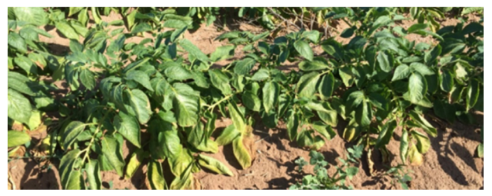
Figure 1: Yellowing of plant leaves and scorching of leaf tips, early signs of salt stress in young potatoes.

For potato production areas, scorching of the leaves during irrigation on hot windy days increases the likelihood and severity of scorching that will occur. With the onset of climate change and higher summer maximum temperatures, the risk of scorching only increases. Scorching of plant leaves reduces the health of the plants due to impaired photosynthesis, akin to damaged solar panels, with overall decreased leaf growth and area.