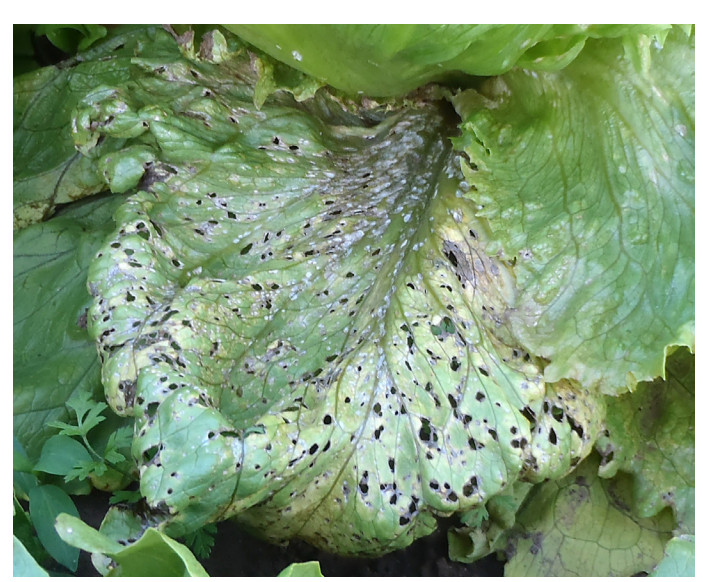
Anthracnose symptoms on lettuce

Lettuce anthracnose is an intermittent disease in Australia, driven mainly by extended periods of wet weather, particularly mild-cool wet periods. When these conditions occur, crop losses can be severe. The disease mainly affects field-grown crops, and while it can occur under protected cropping it is usually less frequent and less severe.