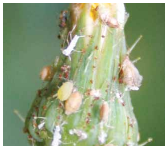
Aphids on a flower head