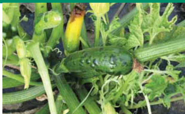
Mosaic symptoms on zucchini