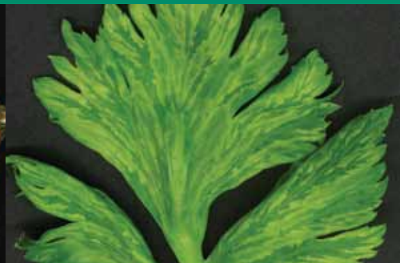
Left to right: Johnson grass mosaic virus symptoms on a corn leaf; papaya ringspot virus on a pumpkin; celery mosaic disease