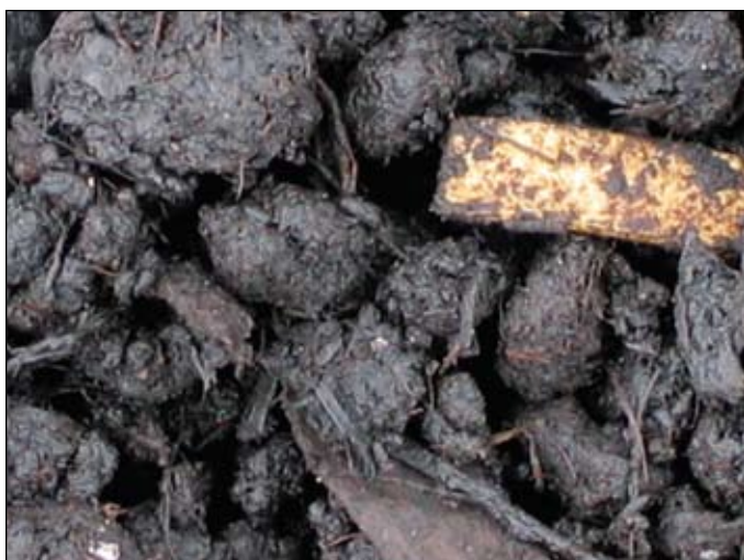
Particle size and aggregation degree will affect curing rates by creating porosity and air in the pile.

It may seem like there are large volumes of organic matter available for composting but that is only partially true, site-specific and changing rapidly. Some farming regions have access to large volumes of high-quality organic matter available to compost for applica-