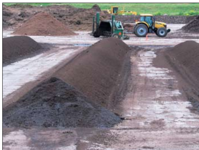
Small piles are used during curing to allow better air and water relations.

the microbes a wide diversity of high-quality organic materials, grow a diversity of plants, mineralize your soil and let the soil animals have free choice.