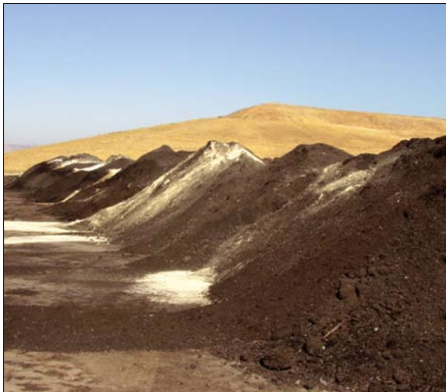
Minerals can be added to the compost pile as food sources and to improve the quality of minerals prior to field application.

Curing occurs after peak heat when the carbon-to-nitrogen ratio is at or below 1:20. When active, composting slows down the readily available food sources for bacteria and fungi, which lowers the microbes' metabolism resulting in lower temperatures in piles with average moisture. There is also low oxygen