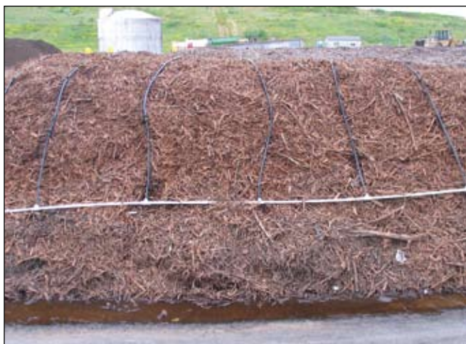
Compost quality is only as high as prevention of pollution is successful. Here wood chip biofilters and leachate collection channels in a concrete composting pad.

Assessment of compost quality should include the ecological effects of compost processes, the compost itself and its effects when applied to soil. Both the process design and how the process is managed will determine the degree to which the compost process prevents damage, prevents pollution and supports diversity