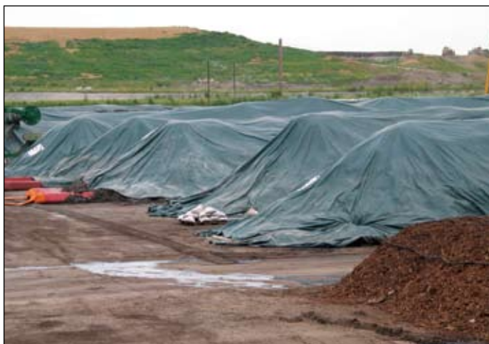
Covers will prevent soaking rains from leaching compost and creating anaerobic conditions from too much water. They also must be removed to prevent anaerobic conditions from too little air.

technician in order to build safe, high-quality compost. Nature knows how to manage the pathogens, and if compost is processed with this in mind there will be little if any need to be concerned with curing anything as there will be no inadequacy to be cured.