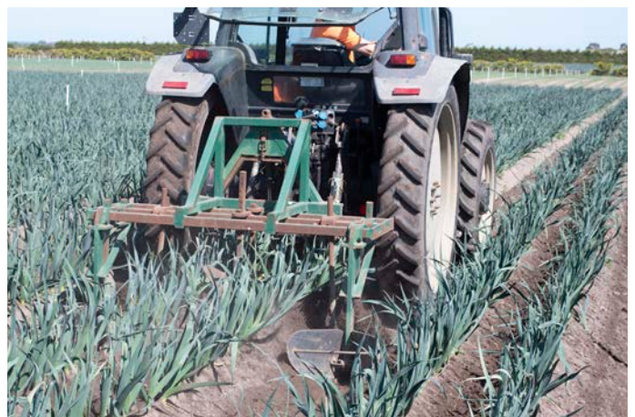
Figure 4 A customised inter-row cultivator, set up to the specific bed and row spacing used on the farm. The cultivator is being used within a more mature leek crop to cultivate within the crop bed as well as the wheel tracks.