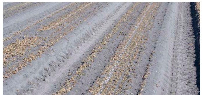
Figure 2 A stale seed bed, ready for crop planting.

The length of time a stale seed bed approach can be used by Schreurs & Sons is usually restricted by the amount of land available to about six weeks. Ideally, Adam would like to use longer-running stale seed beds, using a mixture of glyphosate application and shallow cultivation to germinate and control multiple weed cohorts. This may be feasible in other vegetable crops, and may be helpful where weed seed bank levels are very high (e.g. newly used fields).