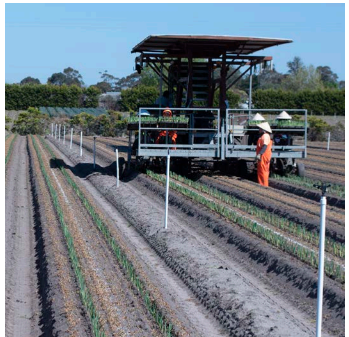
Figure 1 Planting a leek crop.

Today, Schreurs & Sons' most significant crop is celery, with approximately 20,000 tonnes grown each year. Other important crops include leek (Figure 1), spinach, rocket, and snow pea tendrils. Crops are grown intensively year-round, with a winter fallow period.