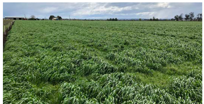
Figure 6 Soil Wealth Integrated Crop Protection cover crop demonstration site, Schreurs & Sons.