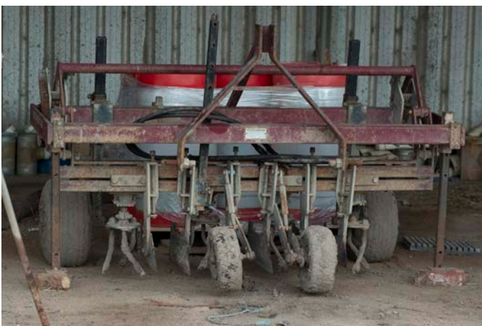
Figure 3 A 'Weedfix' inter-row cultivator, used on the farm in less mature leek crops for shallow cultivation within the crop bed.

Amongst the crops grown on the farm, celery and leeks are particularly suited to inter-row cultivation because of their relatively upright form. However, inter-row cultivation is used to varying degrees within all crops grown by the business.