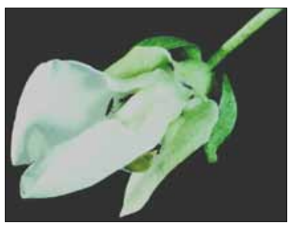
Thrips in a flower

Thrips insects are very small (less than 2 mm in length) so distinguishing between the 13 species of thrips commonly found on green beans is virtually impossible in the field. However, all thrips species are managed in the same way so you only really need to determine whether or not thrips are causing the damage observed in the crop.