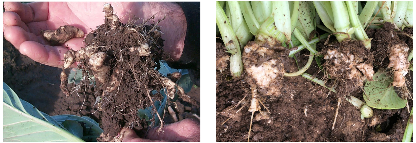
Figure 3: Extensive galls on the root system, typical of higher soil inoculum levels on broccoli (left) and choy sum (right) (L James).

gnarled and stubby or galled with lumps or 'carrots' that dangle from the secondary roots (Figure 3). Severely infected roots eventually decay or rot well before normal harvest, resulting in smaller sized crops and/or delayed harvest.