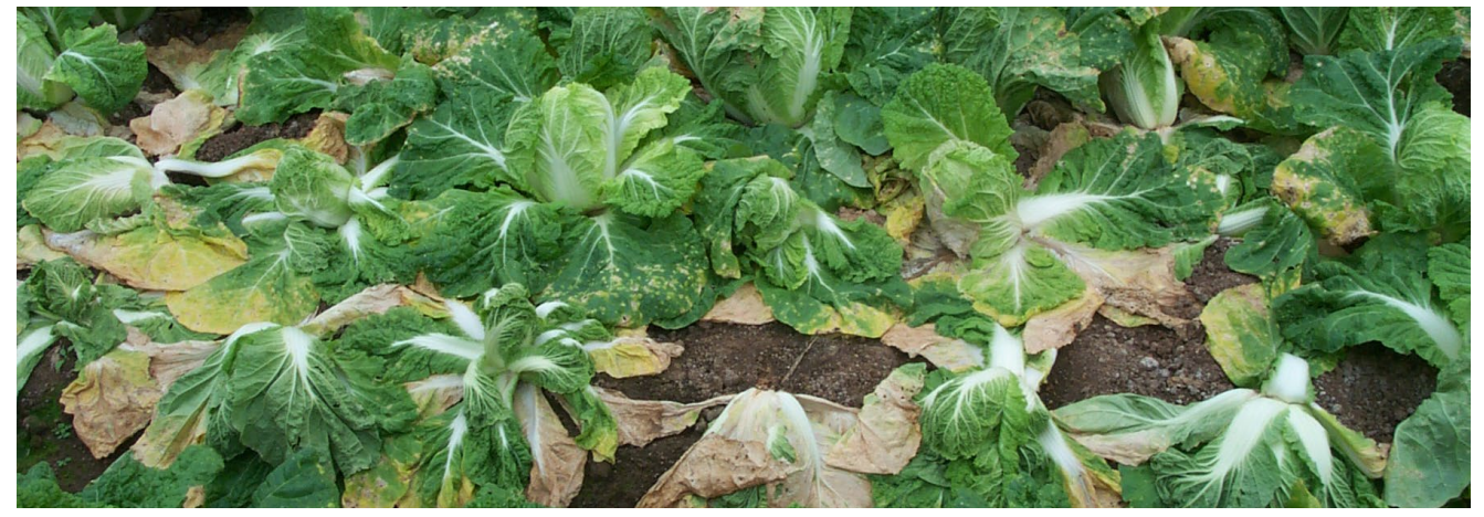
Figure 1: Wilting and yellowing of Clubroot-infected Chinese cabbage (L James).